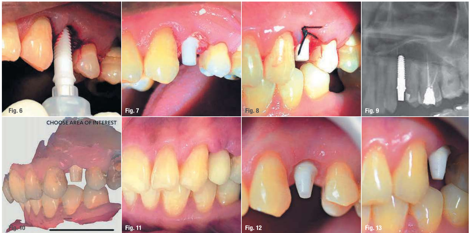
Fig. 6: Placement of the implant. Fig. 7: Bone grafting material placed around the implant body. Fig. 8: The horizontal mattress suture. Fig. 9: Radiograph taken immediately after surgery. Fig. 10: The optical scan after surgery. Fig. 11: The provisional restoration. Figs. 12 & 13: Tooth preparation.

cervical margin of tooth #24. A horizontal root fracture was diagnosed and the patient agreed to his tooth being replaced with a metal-free ceramic implant.